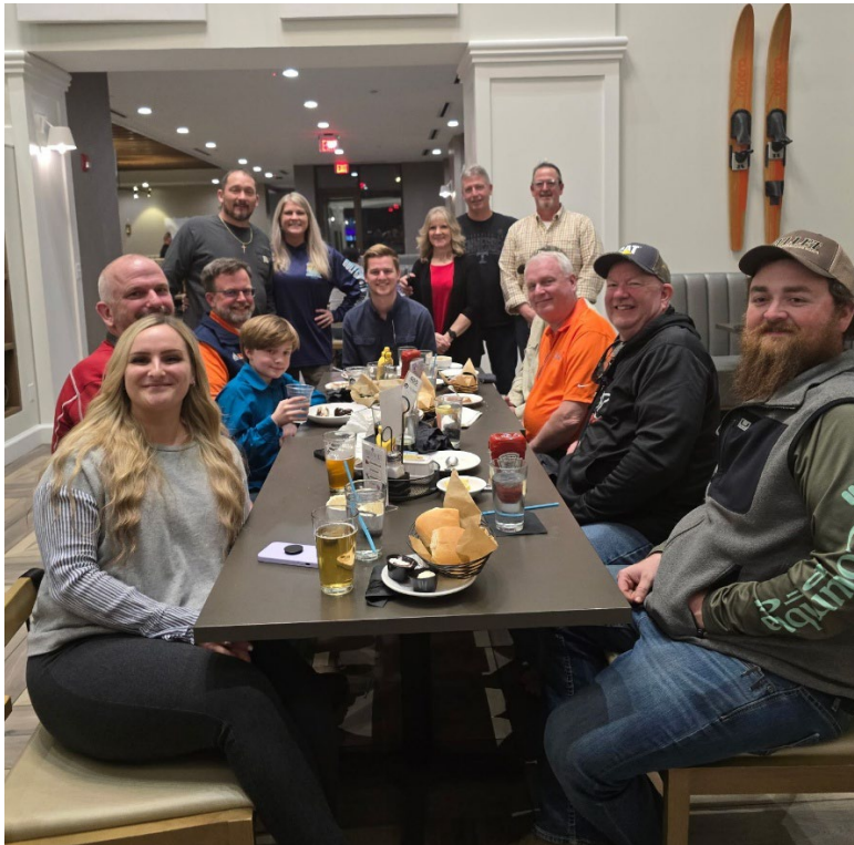
Pre-Tournament dinner at the newly built Paris Landing Lodge.

Hospitality: We THANK the Paris Landing State Park personnel for their hospitality and protection of our equipment and the safety of our staff and participants.