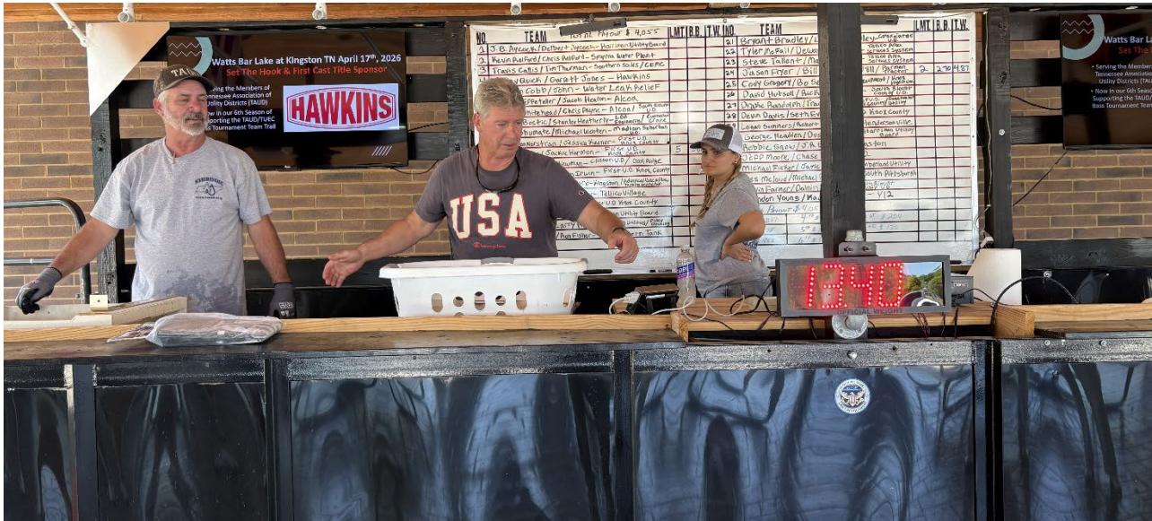
The TUEC Bass Tournament Trail traveled back to East Tennessee for an angler's favorite, Watts Bar Lake at the Kingston City Park Boat Ramp. The weather was perfect with warm temperatures.